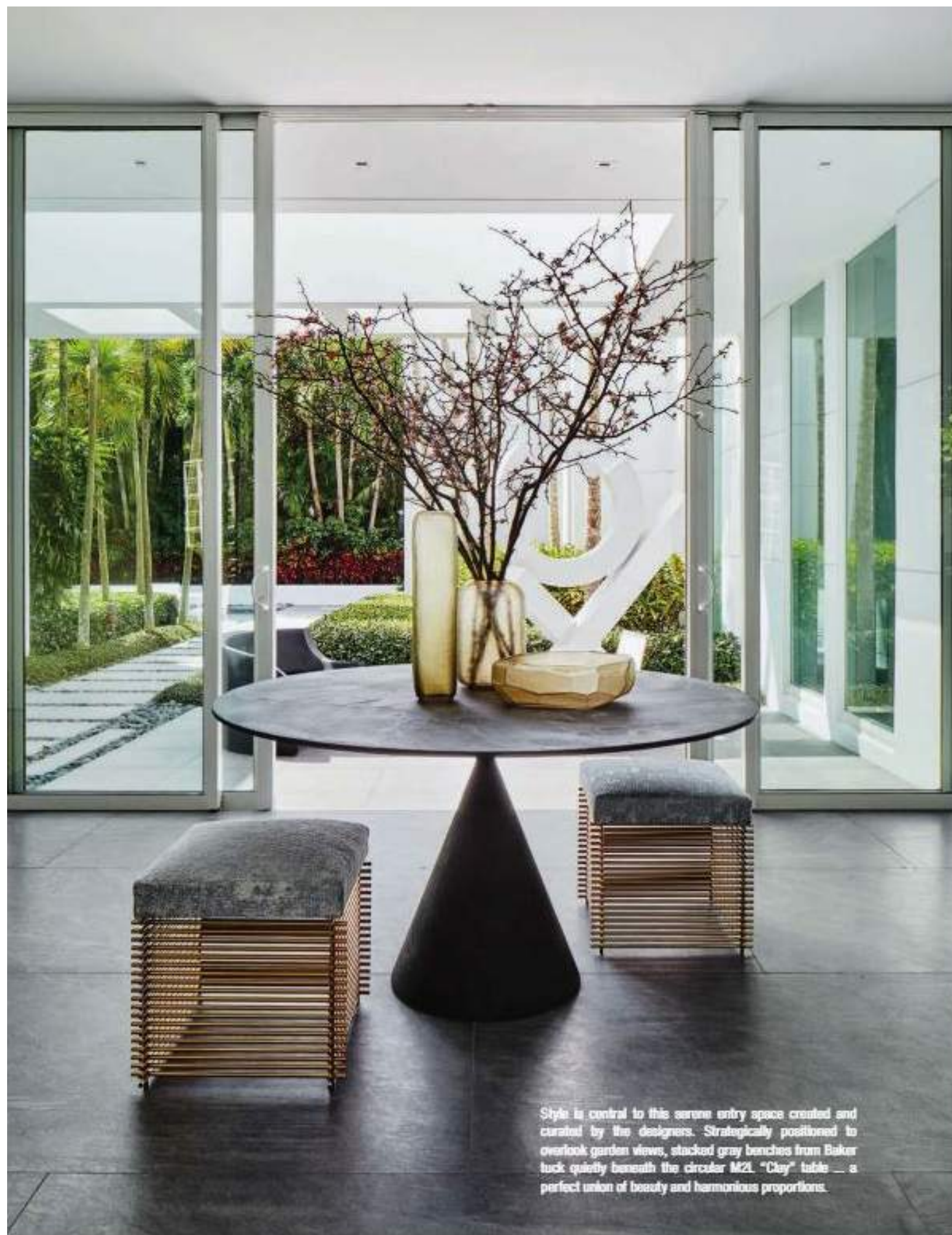
Style is central to this serene entry space created and curated by the designers. Strategically positioned to overlook garden views, stacked gray benches from Baker tuck quietly beneath the circular M2L "Clay" table — a perfect union of beauty and harmonious proportions.

With an emphasis on natural lighting, a towering column and architectural illusions command attention in the kitchen. "Like the rest of the home, the interior epitomizes a relaxed, modern take on luxury living in Palm Beach," interior designer Andrew Kotchen says.